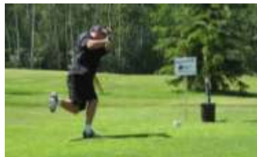
Wiffle Ball Shot